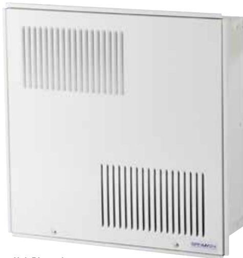
Unit Dimensions: 24" x 24" x 8"