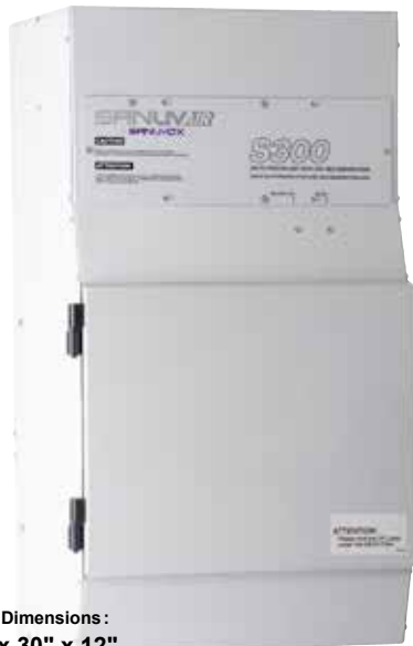
Unit Dimensions: 17" x 30" x 12"