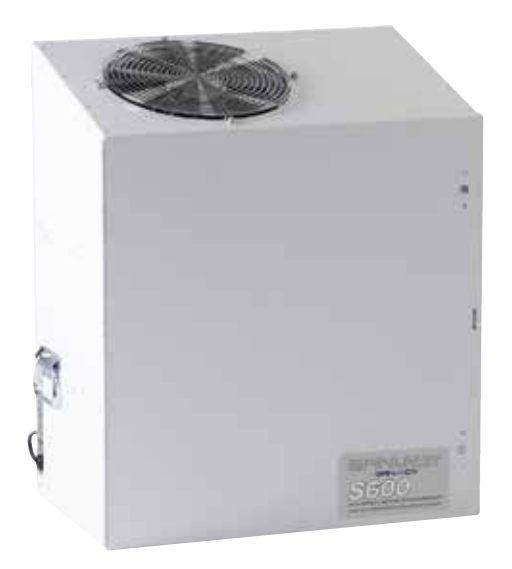
Unit Dimensions: 23" x 27" x 13"